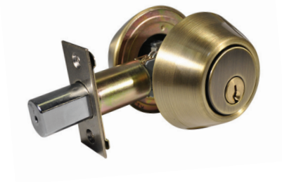
Double Cylinder (78) Shown in 5 Finish with Square Corner