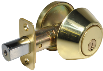
Single Cylinder (75) Shown in 3 Finish with Radius Corner