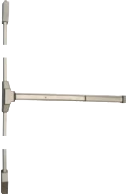
PD921V Vertical Rod Exit Device Shown in 32D Finish