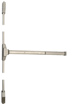
PD921V Vertical Rod Exit Device Shown in 32D Finish