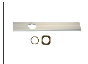
PD92CDKIT • Exit Device Cylinder Dogging Kit • Uses 1 1/4" Mortise Cylinder (not included) • Finish: US28/628