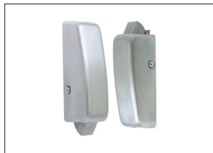
PD92V LATCH • Set of Top and Bottom Latches, for PD9200V