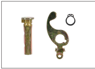
PDDOG • Dogging Assembly