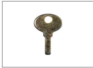
PDKEY • Dogging Key