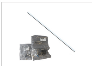
PDSVTR8 • Extension Rod • Extends a 7' Rod to a 8' Rod • Finish: US26D/626